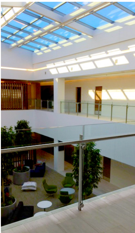
Wet grout attached the posts into steel sleeves which were welded to the structural steel

Project: Celgene Office Location: Summit, NJ Architect: Highland Associates, LTD Glazier: Boss Glass Company Glass Fab.: JE Berkowitz Completion: December 2015 Scope: Celgene recently added 180,000 sq. ft. of office space to their Summit, NJ campus, and utilized Dot series railing for the stairs and balcony overlooks. For the stair application, our patented trapezoidal posts were welded to the steel stair tread. The balcony overlook utilized a wet grout attaching the posts into steel sleeves which were welded to the structural steel. This railing system utilized a 1/2" clear tempered glass infill panel with film applied post installation to achieve desired look.