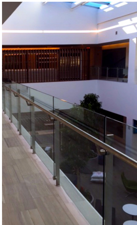
1/2" Clear tempered glass infill panels