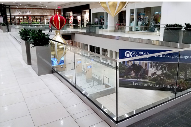
Custom stainless steel cladding forms fit over the aluminum shoe and extend below to cover the top-mounted shoe, lending a continuous look on balconies.

Trex Commercial Products' GlassNut dry glaze system provides a fast and cost effective alternative to traditional wet glazed systems. The GlassNut utilizes a threaded setting block and simple locking nut to secure 1/2" or 3/4" glass infill into the extruded aluminum base shoe system. A gasket can be installed to finish the look of the project. Glass panels are easily replaced by loosening the threaded Nut, setting the new glass panel in, and re-tightening to proper torque specifications.